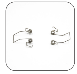
Mounting Clip (metal)